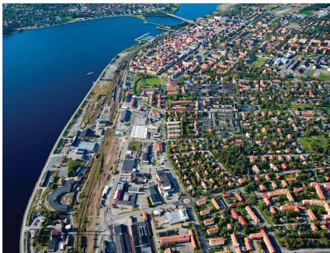
aerial view 20th century