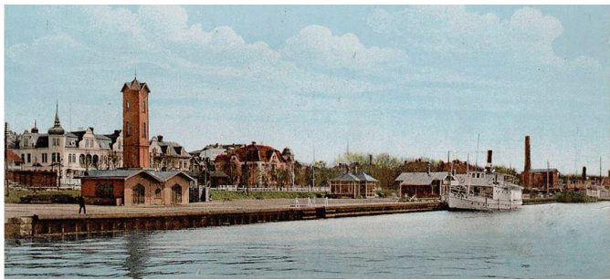
Storsjöstrand, early 20th century