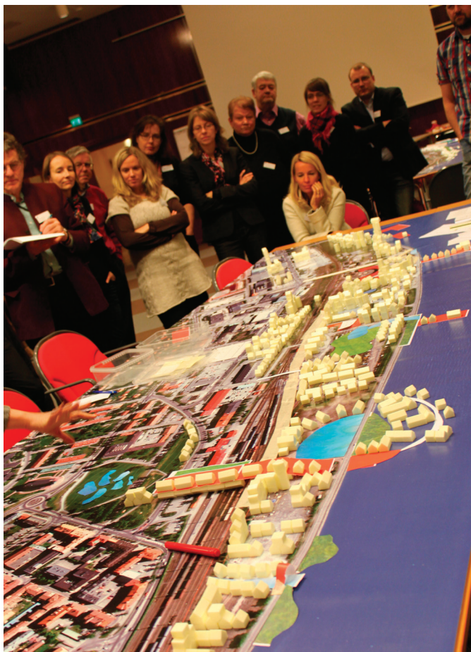
Workshop participants 2012