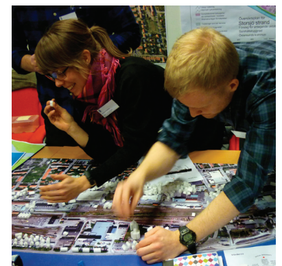
model blocks on top of orthophotos